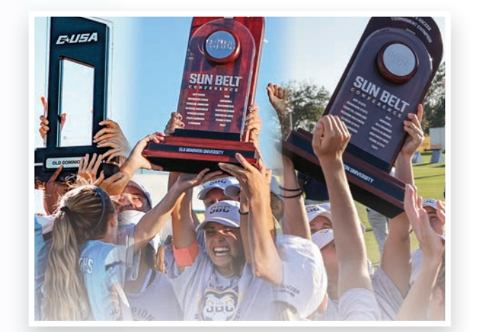
Women's Soccer 3-Peat Champions